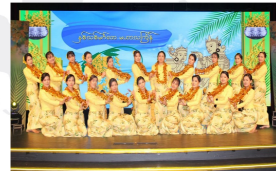
Myanmar traditional dance of OAG's staff during the Thingyan Festival

Each year, before Myanmar New Year's Day in the April vacation, Government Staff enjoy the various activities of Thingyan Festival and the Office of the Auditor General of the Union arranges activities such as offering food to staff, dousing each other with scented water, and holding fun ceremonies.